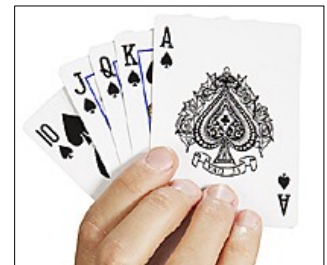
Brett Maverick's hand